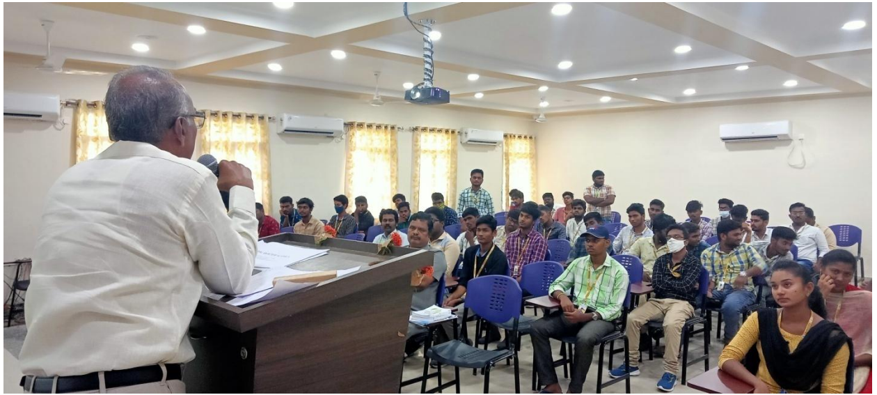
Chief Guest Delivering the lecture