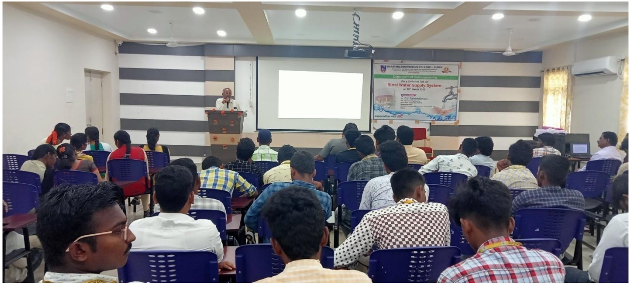
Chief Guest addressing the Gather