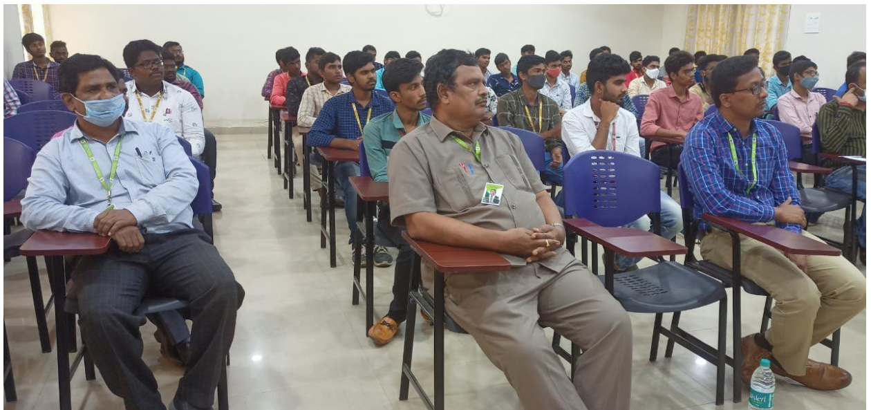
Gathering the students and staff.