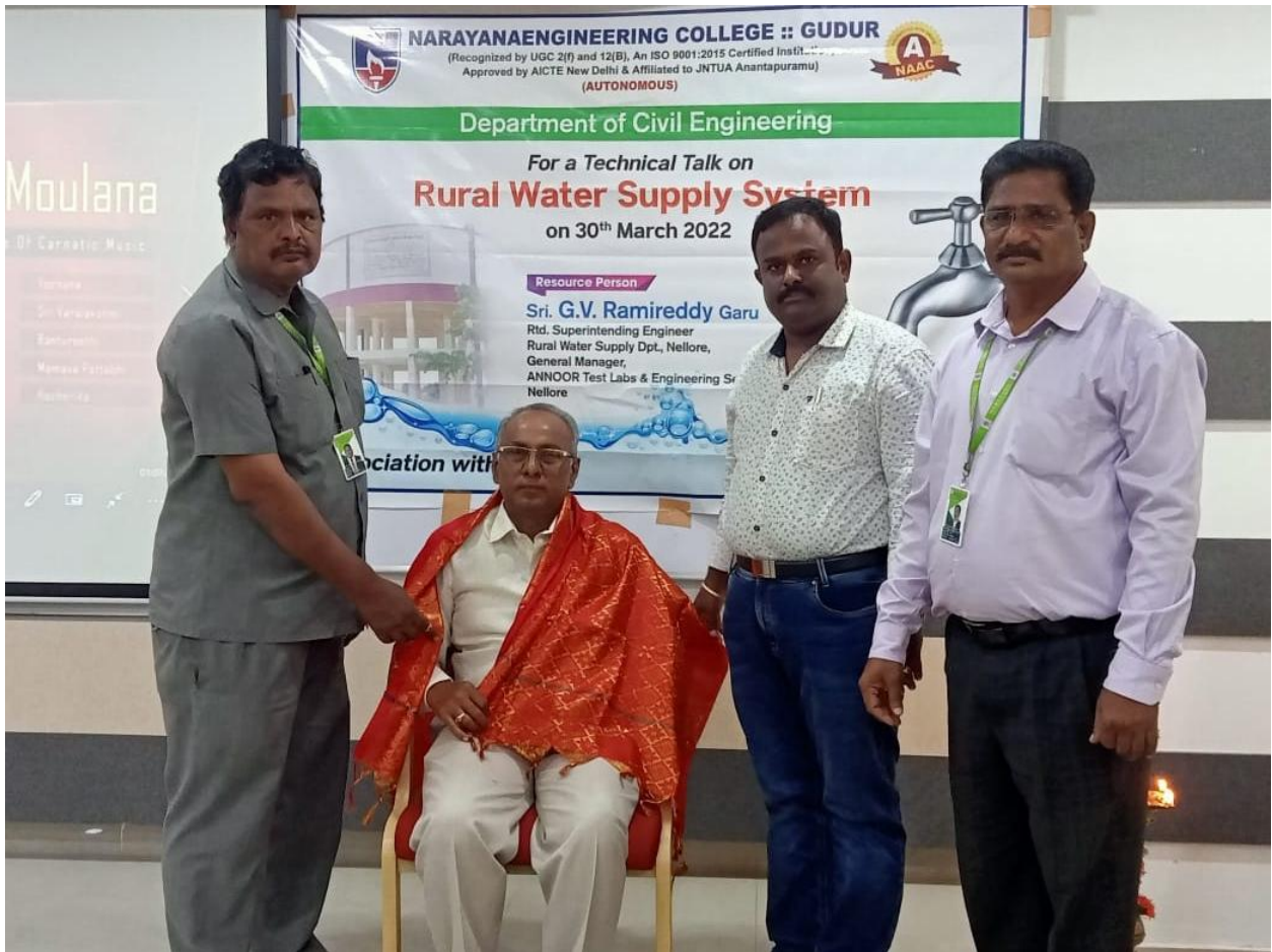
Felicitation to the Chief Guest